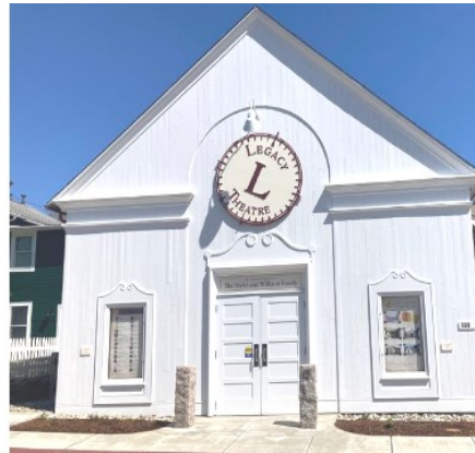
The Legacy Theatre in Branford